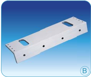
Stick on armature plate holder for glass doors (recommended 3M VHB tape) not supplied

* L-BRACKET NOT REQUIRED FOR FEM5000G. ONLY Z-BRACKET NEEDED.