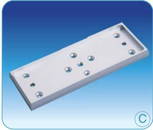
Glass Door Bracket "U-Profile" to fix armature plate to head of 10-12mm glass doors